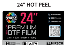
24" HOT PEEL Prism Premium Hot Peel Film 119854 (1) 119855 (6)