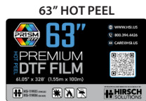
63" HOT PEEL Prism Premium Hot Peel Film 119854 (1) 119855 (6)