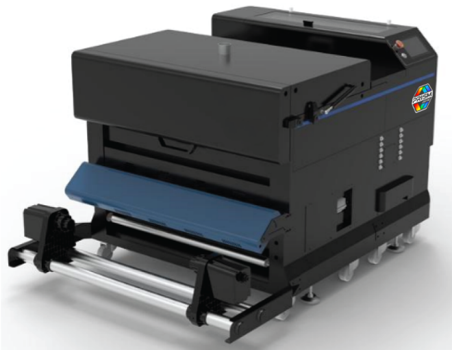
Prism 32" Powder Shaker with Chimney for External Filtration