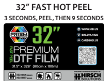
32" FAST HOT PEEL 3 SECONDS, PEEL, THEN 9 SECONDS Prism Premium Fast Hot Peel Film 119976 (1) 119977 (6) (Coming Soon)