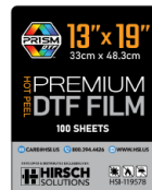
Prism Premium Hot Peel Film 119854 (1) 119855 (6)