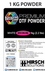
1 KG POWDER Prism Premium DTF Powder 119569