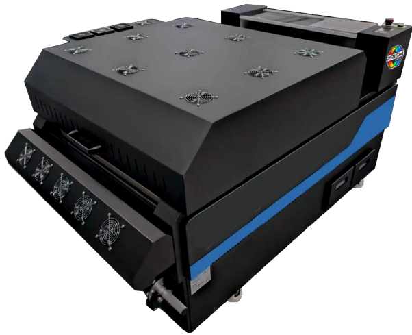
Prism 32" Powder Shaker with Internal Filtration