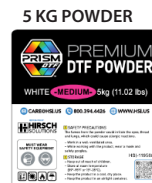
5 KG POWDER Prism Premium DTF Powder 119568