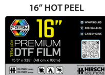
16" HOT PEEL Prism Premium Hot Peel Film 119854 (1) 119855 (6)