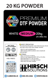
20 KG POWDER Prism Premium DTF Powder 119573