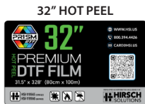
32" HOT PEEL Prism Premium Hot Peel Film 119565 (1) 119566 (6)